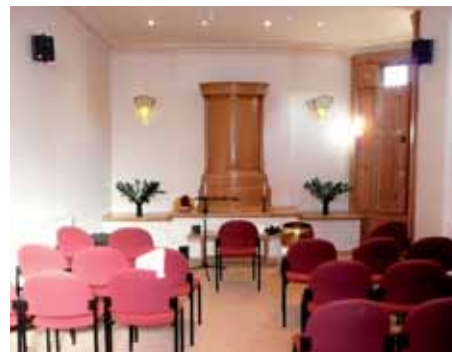
■ Chanting Room