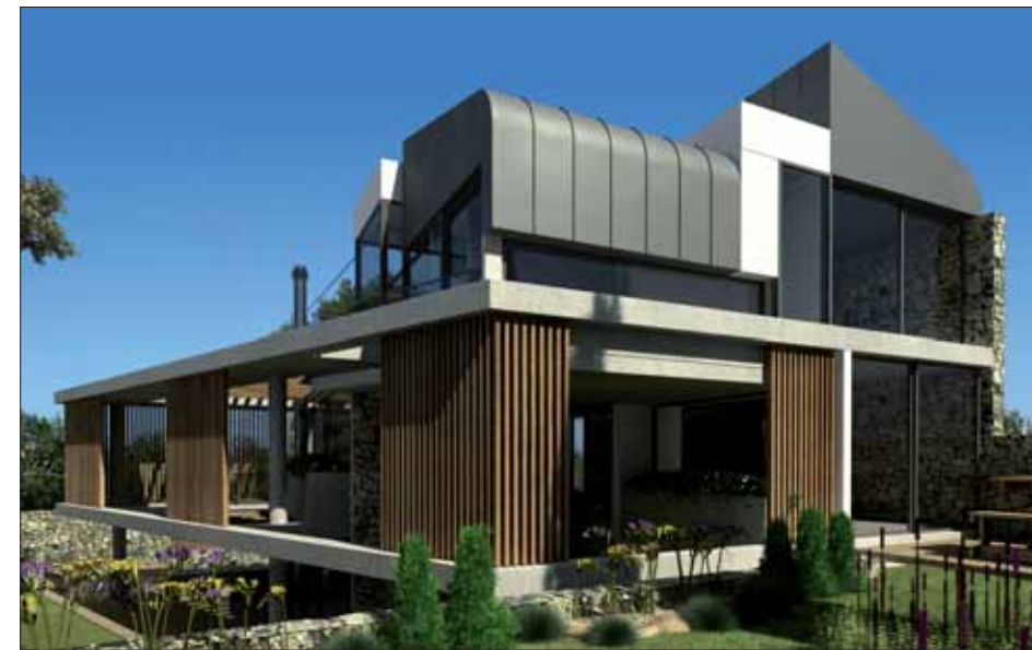
■ Exterior of Villa

Arsene Wenger accompanied by Mark Ramprakash officially opened the new facility on 29th November 2007 with Wenger overseeing some local children training on the new pitch.