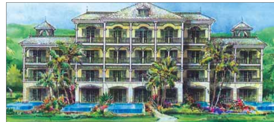
■ Villa Block