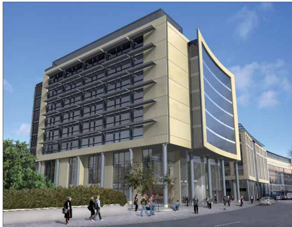
■ Wellbar Central, Newcastle