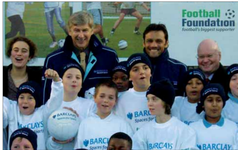
■ Arsene Wenger opening the facility

Following the success of the Whittington Park floodlit third generation synthetic football pitch refurbishment, London Borough of Islington appointed Millbridge as Project Manager for Arsenal Football Club's flagship football in the community Football Foundation facility at Rosemary Gardens. Funded, in principle, by Barclays Bank and in partnership with the London Borough of Islington and Arsenal Football Club, the existing redgra pitch has been replaced, which now includes floodlighting, as well as a new changing room complex and lighting within the park.